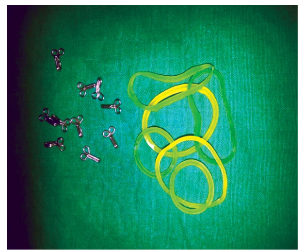
Fig. 1: Hooks and rubber band used for ETEWC

On examination two wound were found over post aspect of left thigh. Upper wound was of size 15x6 and lower wound was of size 5x3cm. Both wounds were covered with thick and adherent black eschar. Surrounding skin was found to be indurated and unhealthy. Both wounds were found to be deep up to