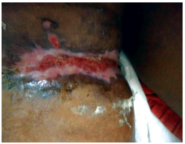
Fig. 7: Upper wound after 3 weeks