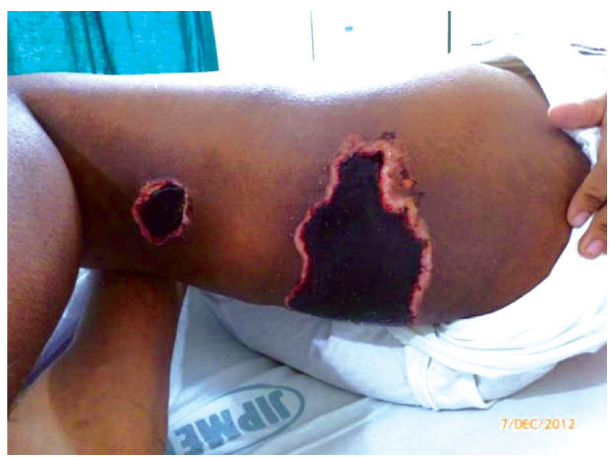
Fig. 2: Wound, before debridement